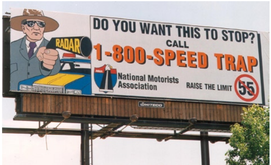
NMA Billboard on I-90 near Albany, NY (June 1994). The 800 service was an early forerunner to the present-day The National Speed Trap Exchange at www.speedtrap.org

He had enough support in the committee to force Rep. Howard to compromise. The compromise was that the full House would vote on the amendment and Representative Howard and Senator Symms would